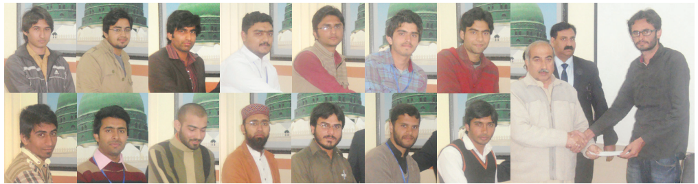
Students being awarded meritorious scholarships at Amin Campus

The University of Faisalabad awarded scholarships to meritorious students who secured top positions in final results of the Fall 2013. The ceremony was held at Amin Campus.