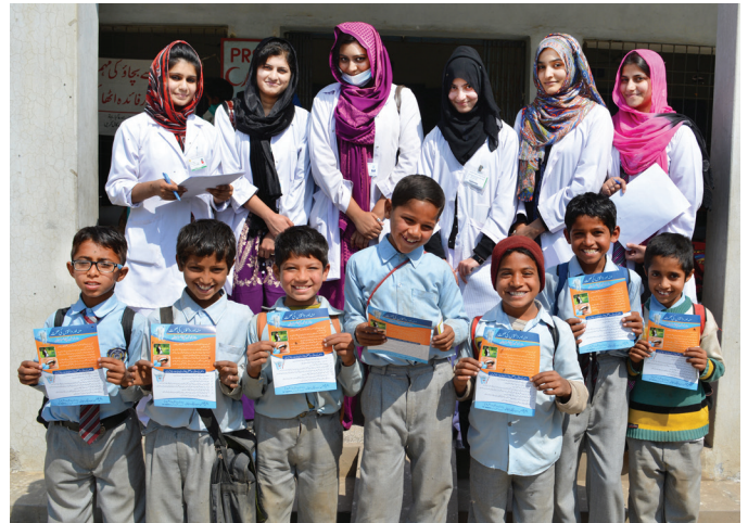
Dentists from MTH and BDS students of UMDC performing dental checkups of school children at free dental camp