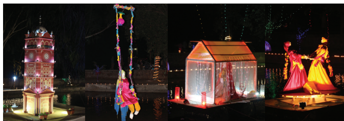
Floats prepared by the students of TUF

In the context of Jashn-e-Baharan March 2014, 'Canal Mela' was organized on Canal Road of Faisalabad, by the District Government. In this festival different schools, colleges and universities of Faisalabad participated by preparing different floats representing historical places and culture of Faisalabad. The University of Faisalabad also participated in this event and the students of TUF decorated the venue