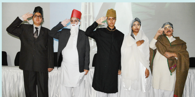
Students performing in a tableau regarding 'Pakistan Resolution Day'