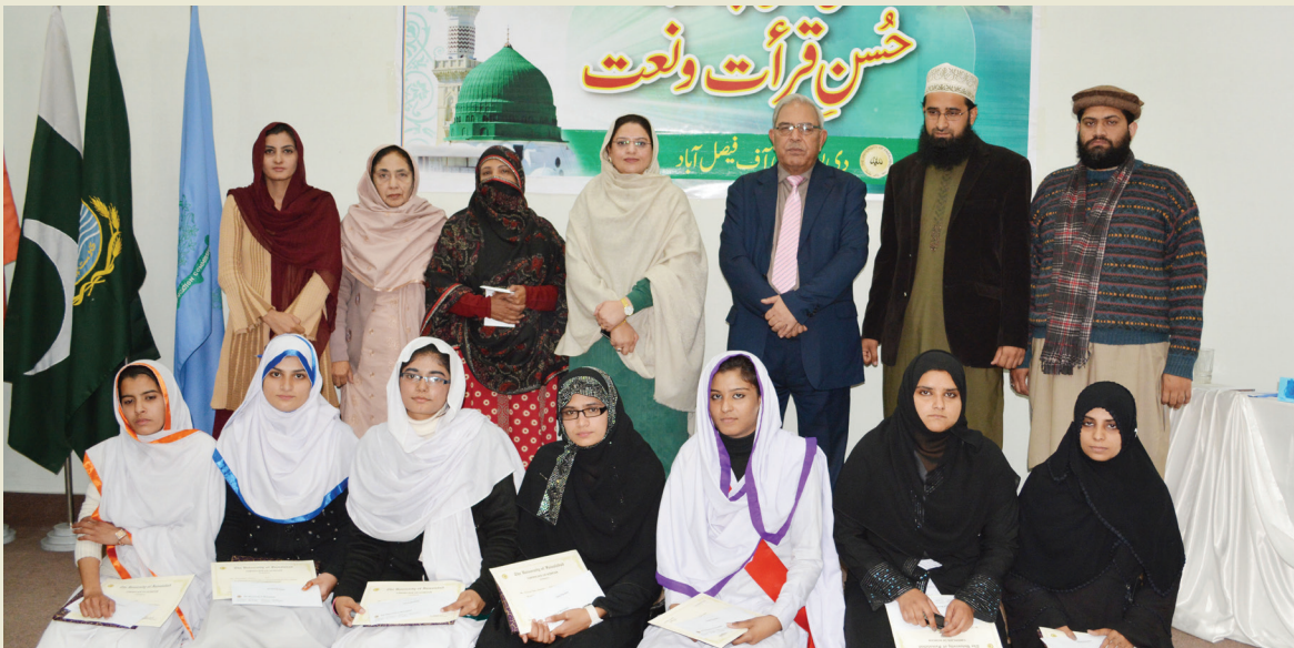
Group photo- Winners of Inter Colleges Qiraat & Naat Competitions with chief guest and faculty members of TUF

The winners were awarded cash prizes and certificates