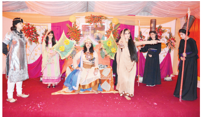
Students performing a skit during welcome program for Pharm D students