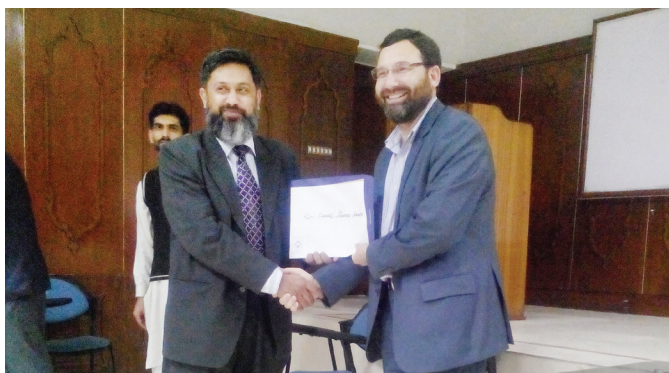
Workshop on "Professionalism in Physical Therapy" jointly conducted by TUF & Riphia Islamabad