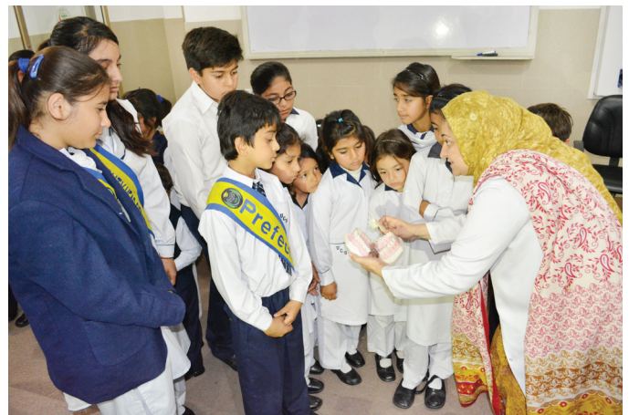
School students are being taught how to brush their teeth

A team of doctors & students from MTH also visited Fun-land where they set up stalls and educated general public regarding oral health.