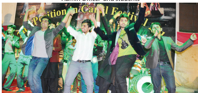
Musical Night - TUFians celebrating 2nd position in Canal Mela 2014