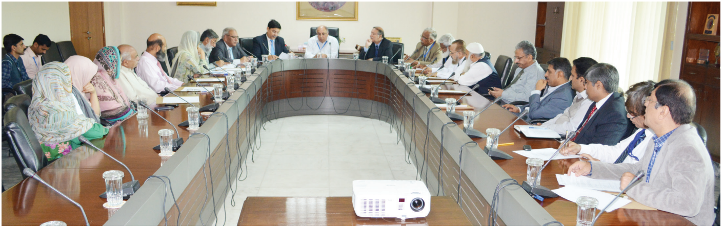
Meeting of Academic Council of UMDC in progress