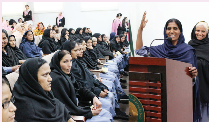
Female staff singing folk song