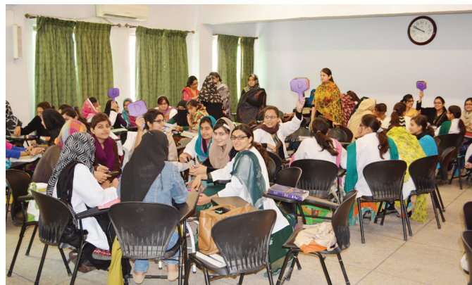
MBBS students during the TBL session