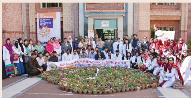
Faculty members and students celebrating 'Brain Awareness Week'