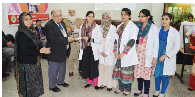
Winners of models and charts competitions receiving prizes