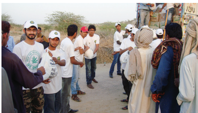
TUFIANS distributing bags of edibles amongst the affected people