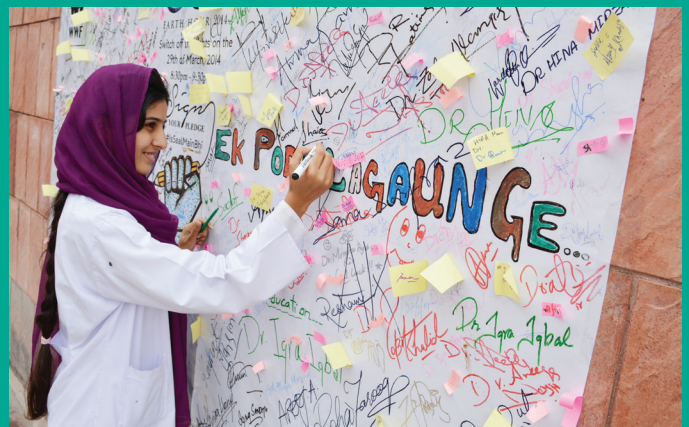
TUFIANS signing pledges for WWF Earth Hour University Challenge 2014