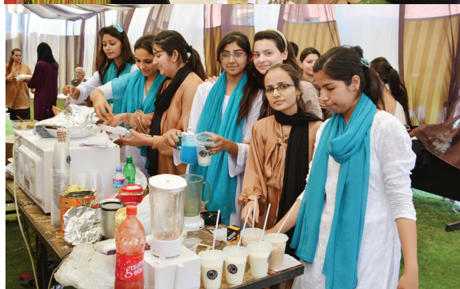
Students at the stalls