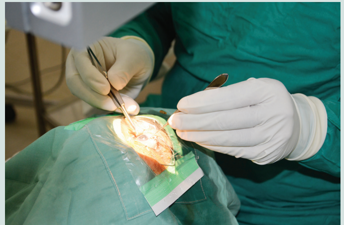
A view from operation theatre of Ophthalmology