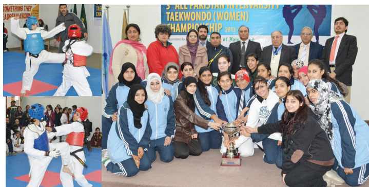
Taekwondo players in action

The managers and coaches of all the teams commended the efforts of management of TUF for organizing this mega event in magnificent way.