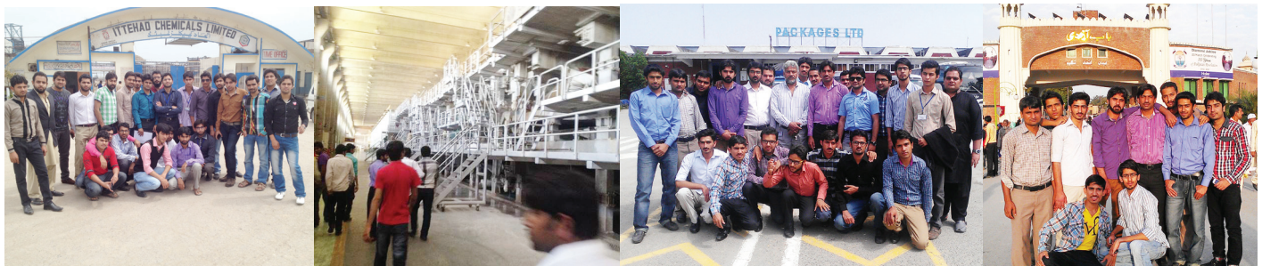
Students of Chemical Engineering during industrial and recreational tours

Students of 8th semester visited Fecto Cement Islamabad, Pakistan Monument, Centaurus and recreational tour to Murree. Students of 6th semester visited PARCO Oil Refinery and PACKAGES, Lahore. Students of 4th semester visited Ittehad Chemicals, Lahore and Century paper & Board Mills, Lahore. They also visited Wagha Border, Fortress Lahore. While students of 2nd semester visited Sitara Chemical Industries Ltd., Kashmir Ghee and Lyallpur Chemicals & fertilizers (pvt) Ltd. During their visits, a briefing was given to students to understand the whole process of manufacturing. Students were encouraged to participate and raise questions about various parts of the plant and process.