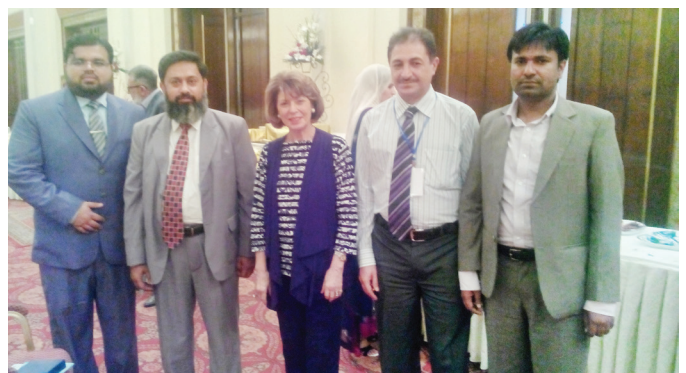
Faculty of Rehabilitation Sciences TUF with president World Confederation for Physical Therapy (WCPT)