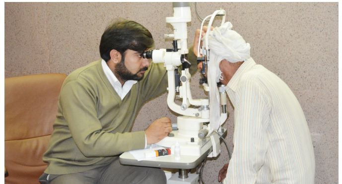
Eye examination during free eye camp at MTH

Department of Ophthalmology, Madinah Teaching Hospital, organized a 3-day free eye camp at MTH from 21st to 23rd February 2014. Free eye treatment was carried out by expert Ophthalmologists of MTH. More than 2100 patients were screened and provided eye check-up facilities through advance eye instruments while medicines were also provided to the patients free of cost. Approximately 300 patients were operated for cataract and implantation of intraocular lens.