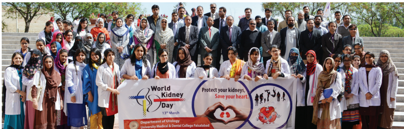
Group photo- The participants of the awareness walk on 'World kidney Day'