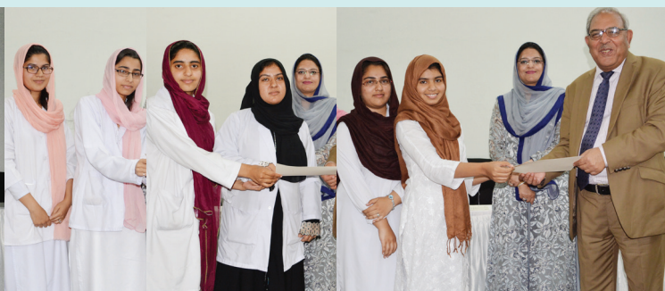
Winners of quiz competition receiving prizes