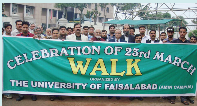
Faculty members and students during 'Pakistan Resolution Day' walk at Amin Campus