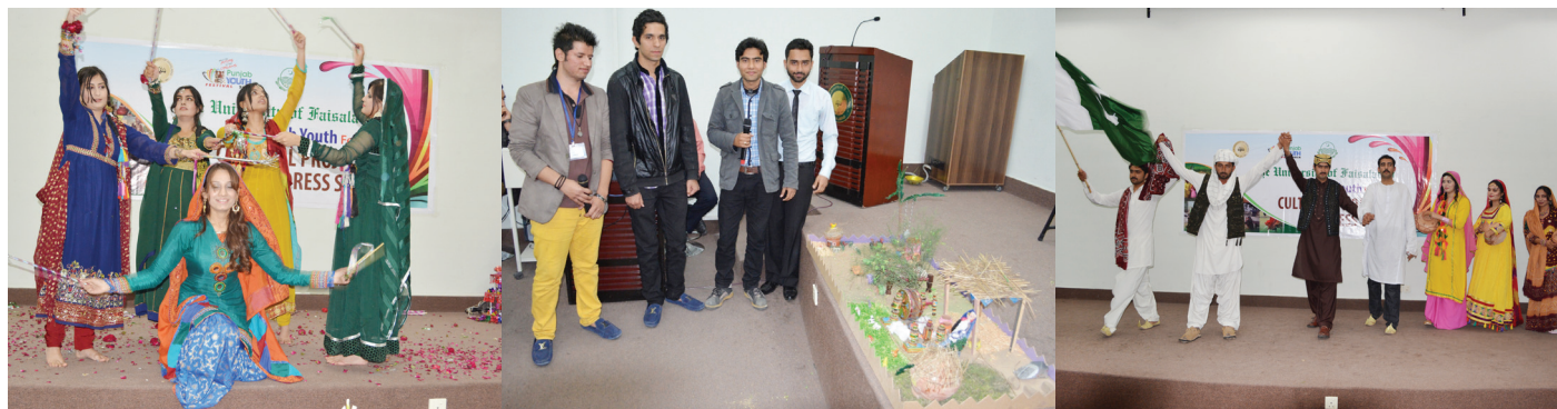
Students participating in Intersarsity Cultural Projects & Dress Show competitions