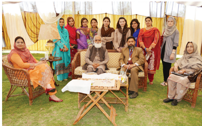
Faculty members of TUF at Cupisco Café launch ceremony