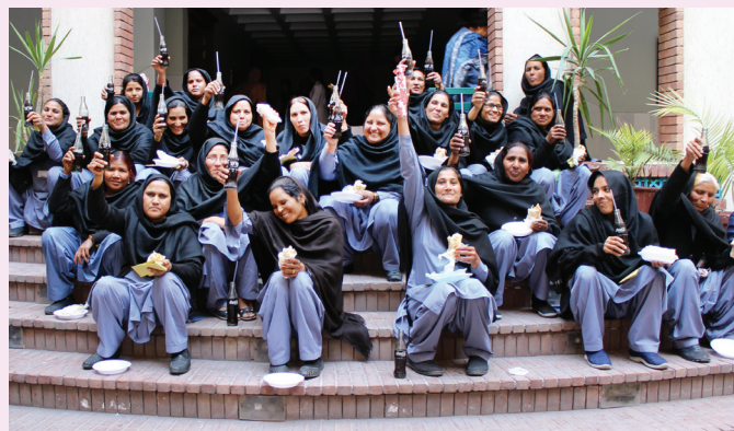
Female Janitorial Staff enjoying their meal