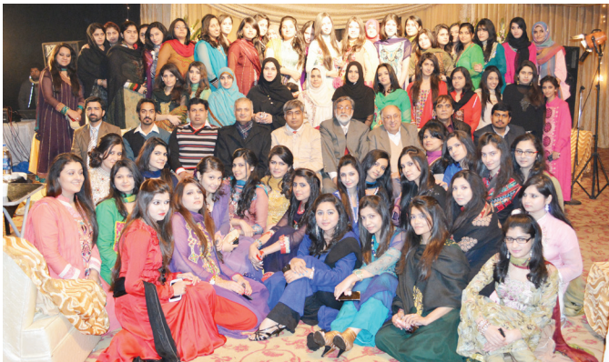
Group Photo - Farewell Ceremony for BDS final year students