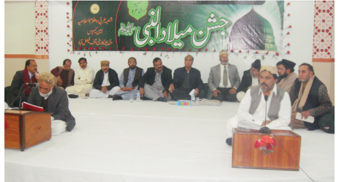
Poet offering Naat during the Mehfil e Mushaera

The program ended with Dood o Salam and Dua.