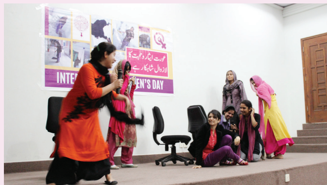
Students presenting a tableau regarding role of women in a society