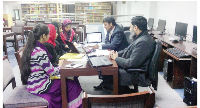
Research supervisory session for 23 research projects of Physical Therapy at TUF