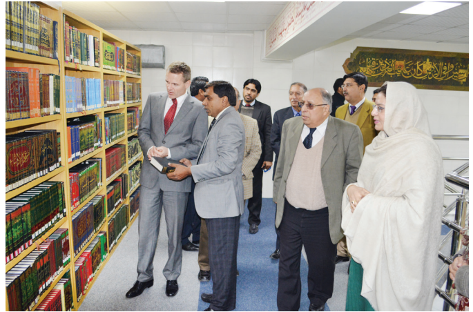
Ambassador of Denmark visiting Islamic section of Noor-e-Siddiq-e-Akbar Library