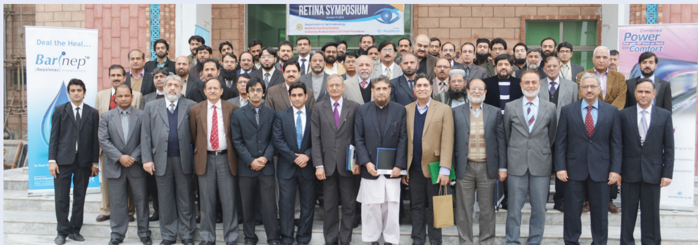
Group photo – Participants of Retina Symposium