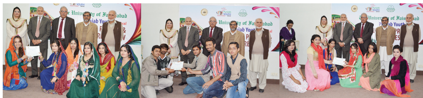
Winners of Projects & Dress show Competitions with senior management and faculty members of TUF