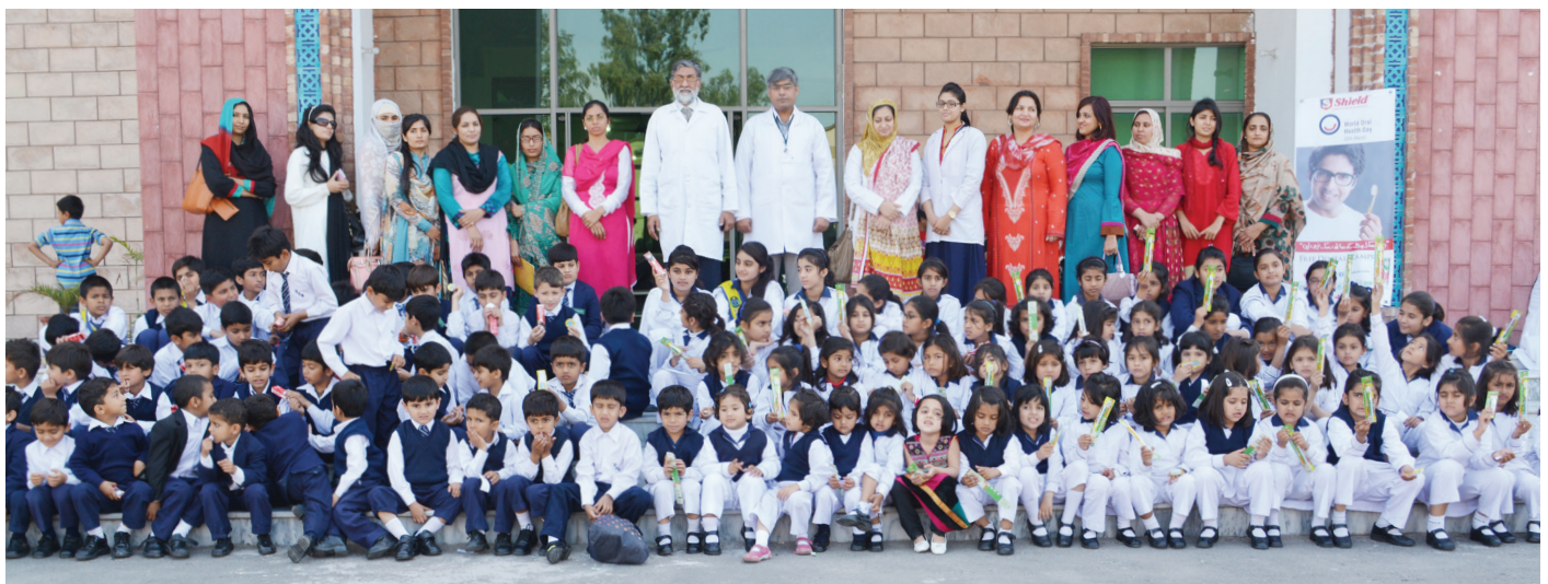
Students of University Cambridge School at MTH Dental Clinics on the occasion of World Oral Health Day