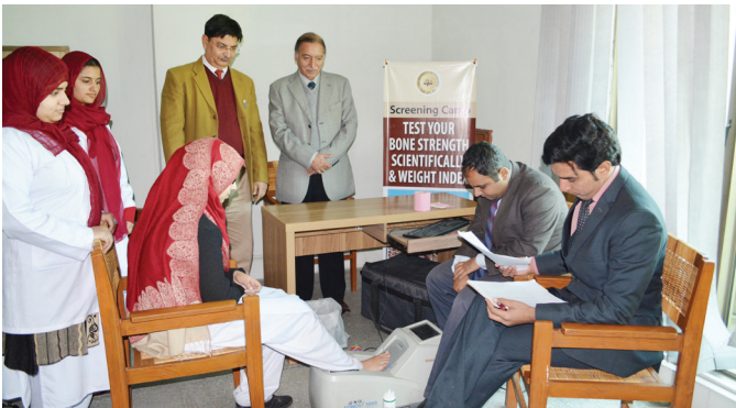
Screening Camp for Body Weight, Bone Strength, and Nutrients Indices